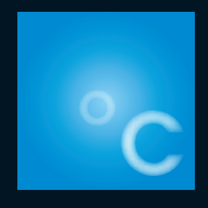
80% HEAT BLOCK

Advanced glazing technology blocks 80% of the radiant heat but still lets more light in than a plastic dome skylight. It won't deteriorate over time, either.